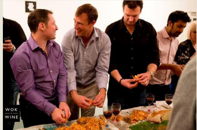
Wok n Wine, October 2014.

The 63m 2 space can accommodate between 30 to 50 guests.